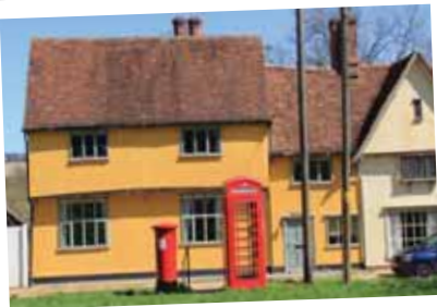
Cottages at Hartest

This is a rural route which takes you through villages in High Suffolk overlooking the Glem Valley and past some notable houses. Both routes are moderate and take in a few hills, but there are excellent views across the Suffolk countryside.