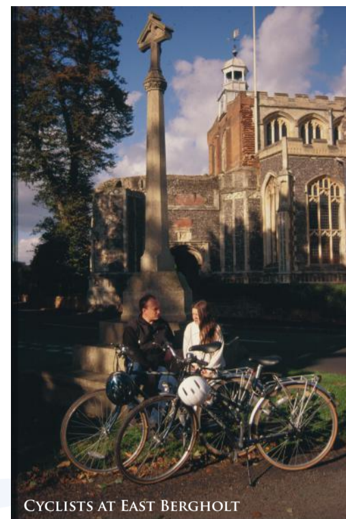
CYCLISTS AT EAST BERGHOLT