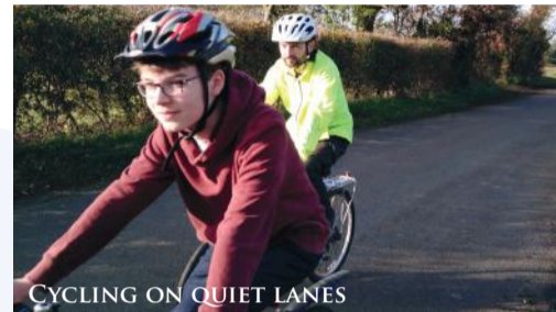
CYCLING ON QUIET LANES

You can download full route instructions and find information about facilities and highlights along the route at www.dedhamvalestourvalley.org/visiting/visitor-guides/cycle-guides